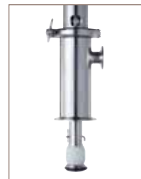
Toftejorg SaniMidget Retractor